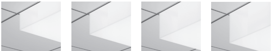
4" 5" 6" 7"