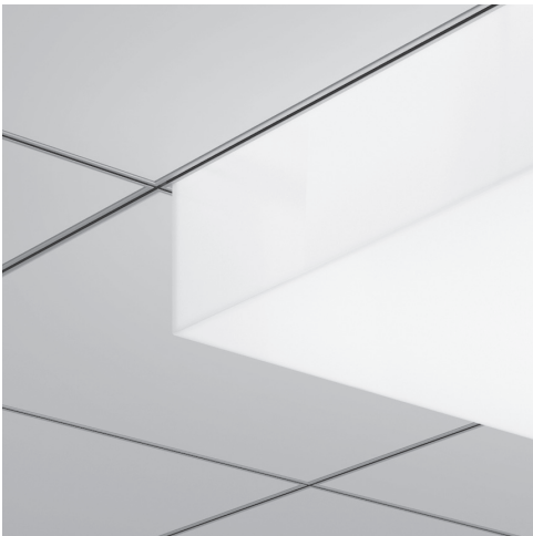
SkyeFall 5" drop lens