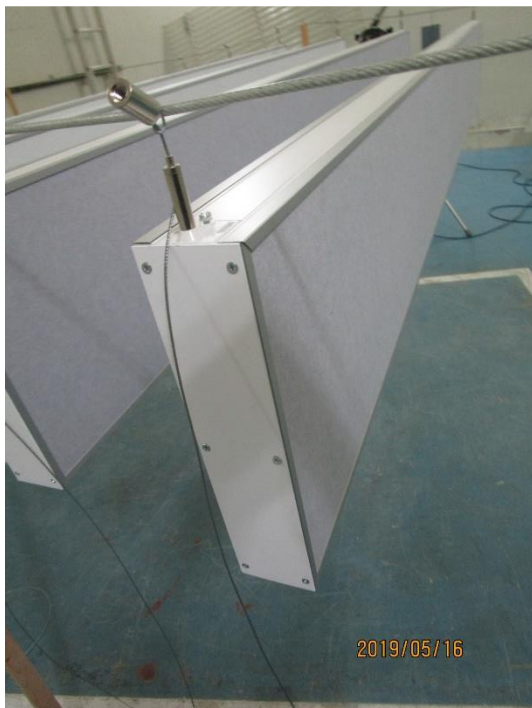
Figure 2 – Detail of individual fixture