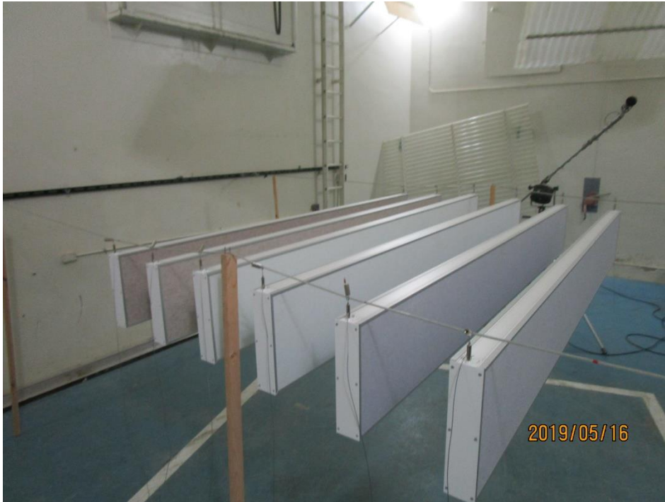
Figure 1 – Specimen mounted in test chamber