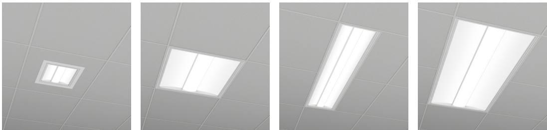
1' x 1' 2' x 2' 1' x 4' 2' x 4'