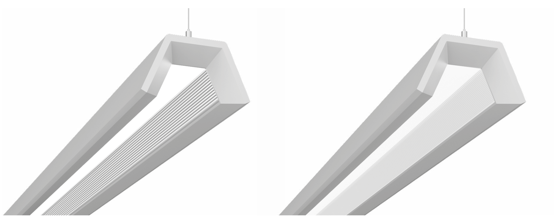
Microgroove Extruded Aluminum side shielding with upper acrylic lens (MAL)

Zen is the soft-light solution for inverted-U pendant forms. It is the only suspended luminaire of its kind to provide such comfortable and effective (up to 112 lm/W) lighting, emitting more downward luminance from the top than from the sides.