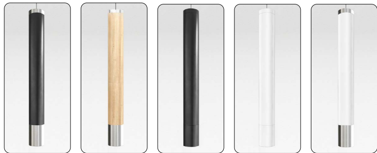
Black with Silver Chrome trim Wood with Silver Chrome trim Black with Black trim White with White trim White with Silver Chrome trim