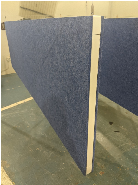
Figure 2 – Detail of specimen materials