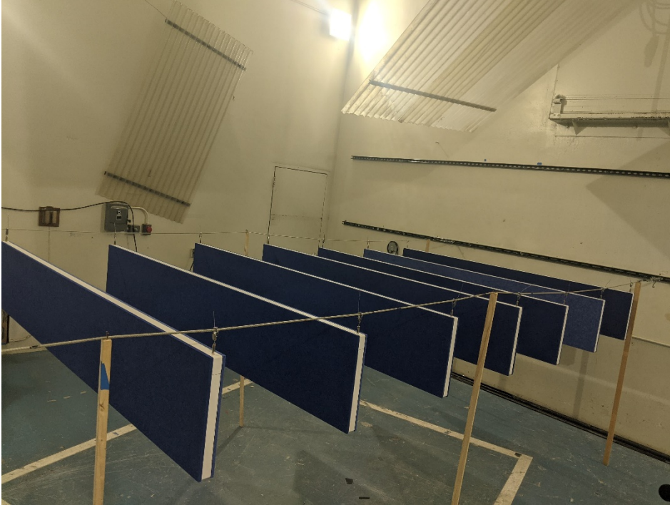
Figure 1 – Specimen mounted in test chamber