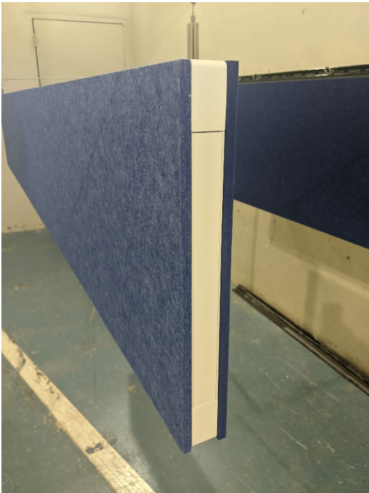
Figure 2 – Detail of specimen materials