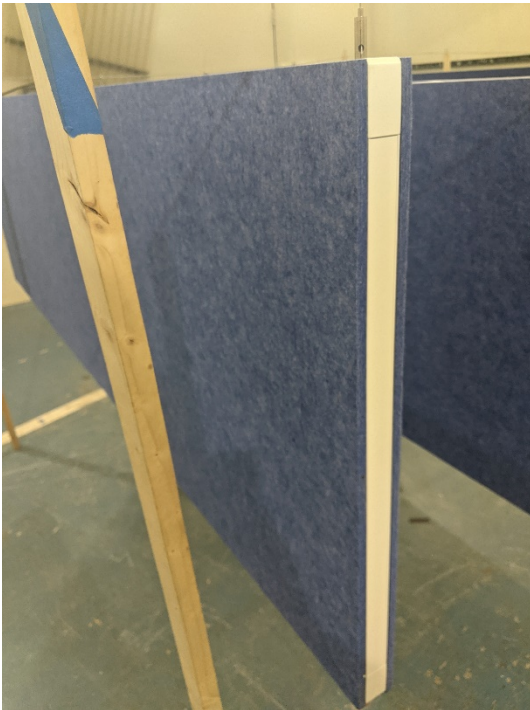
Figure 2 – Detail of specimen materials