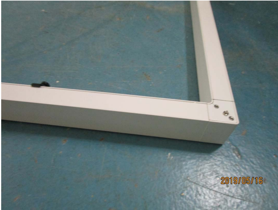
Figure 3 – Detail of frame edges, prior to installation of felt panel