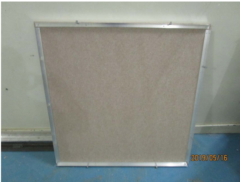
Figure 2 – Individual felt panel prior to mounting in fixture frame