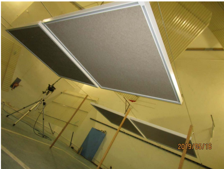
Figure 4 – Underside of installed test specimen